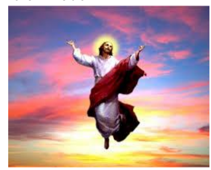
GOSPEL Page 617 15:26-27,16:12-15 The reading from the Holy Gospel according to John.

Come, Holy Spirit, fill the hearts of your faithful and kindle in them the fire of your love. Alleluia!